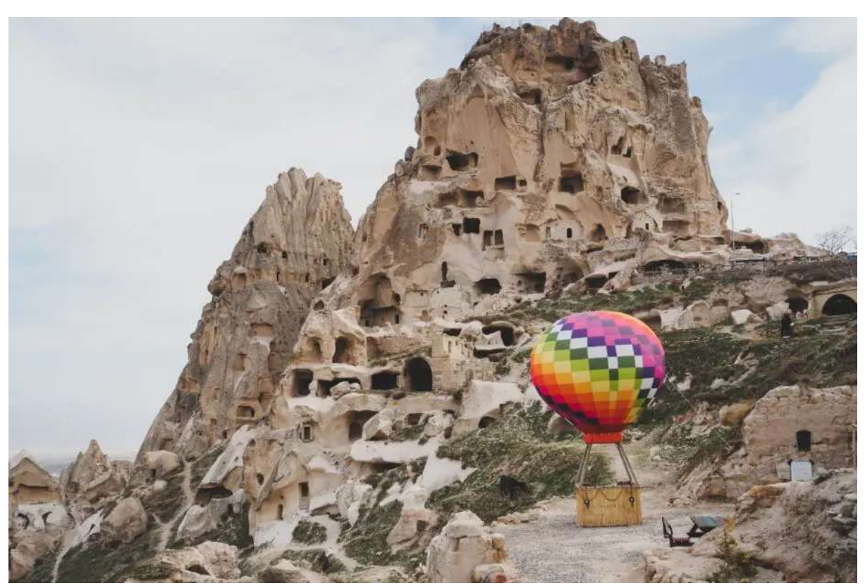
Next station is Pigeon Valley and Zelve Underground City. Pigeon Valley, an essential part of the list of must-see places in Cappadocia, is located between Uçhisar and Göreme. The

After arrival, Indian Lunch at an Indian Restaurant. After lunch we will visit first Zelve open air museum. Zelve Village is situated on the steep northern slopes of Aktepe and comprises three valleys. The first valley contains a mill (seten) used for the production of bulgur, Balıklı and Üzümlü Church, and a winery in the east. The second valley is home to the Church of the Holy Cross. The village square and a monastery complex carved into a dome-like rock mass are located in the third valley. At the exit point of the valley there is the Direkli Church.