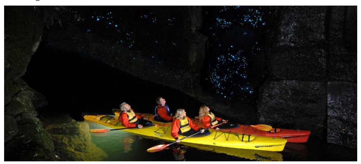
After the tour, continue your journey onwards towards Rotorua. Upon arrival, check-in at your hotel there.

guided tour, you can also indulge in adventure activities like black-water rafting and abseiling.