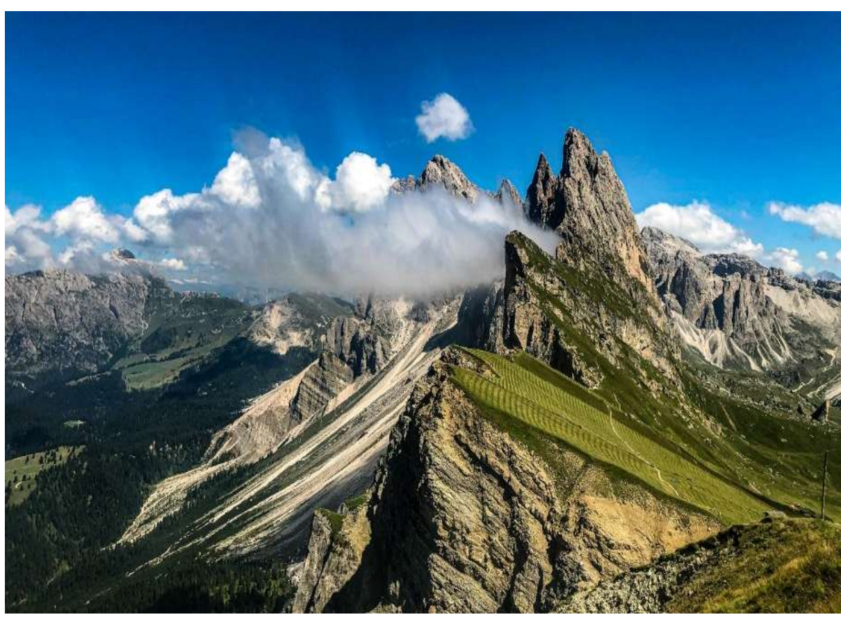
Overnight stay at the hotel in Cortina d'Ampezzo

enjoy the region's culinary legacy while taking in the views at these rustic cafés, which provide hearty meals created with local ingredients.