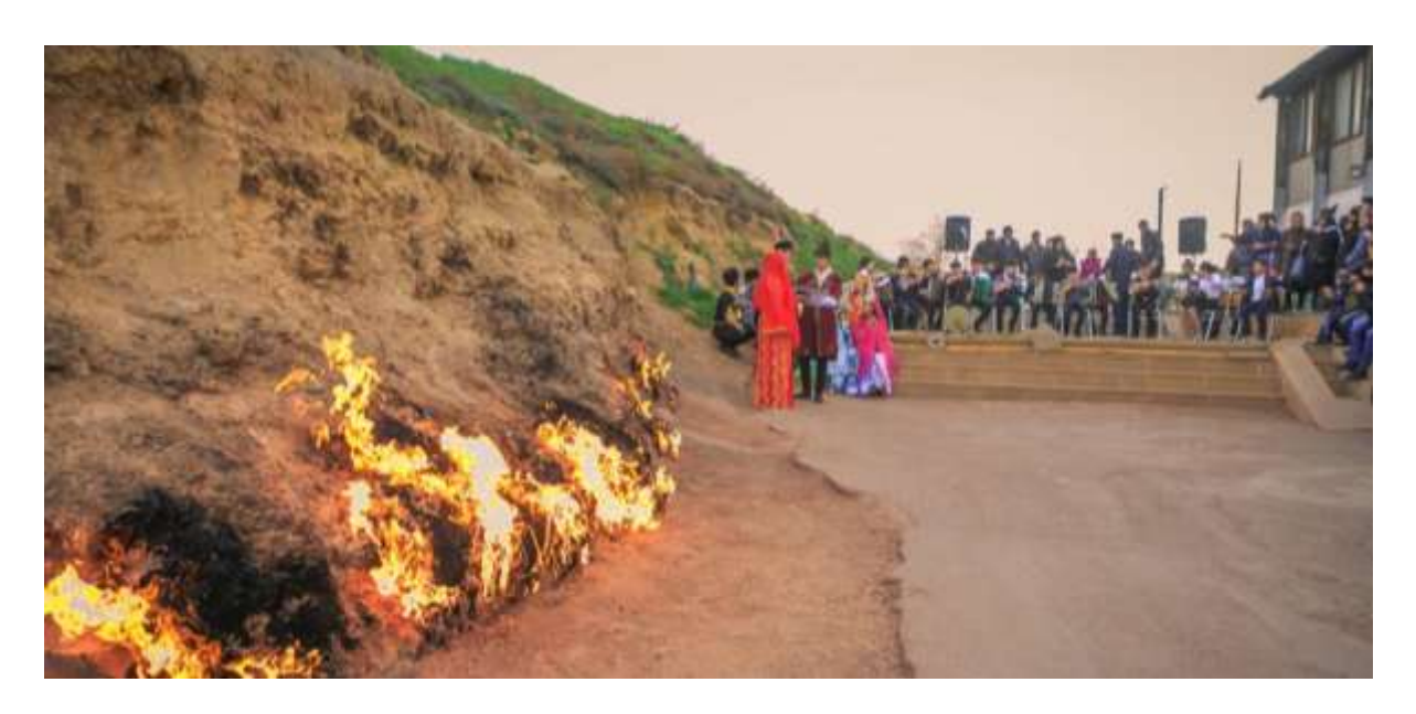
DAY 02: TRANSFER TO QABALA BY DRIVE

After breakfast, check out from the hotel. We will proceed to Qabala in Azerbaijan by drive and on arrival check-in at our hotel there.