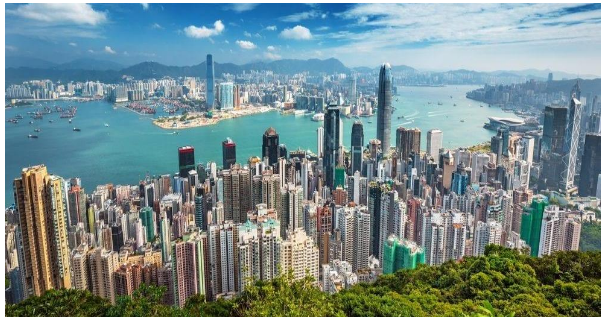
and a potbelly of numerous cultures, it offers numerous touristic attractions such as the beautiful tram ride to Victoria Peak , ferry ride at the wonderful Victoria Harbour and Disney Land.